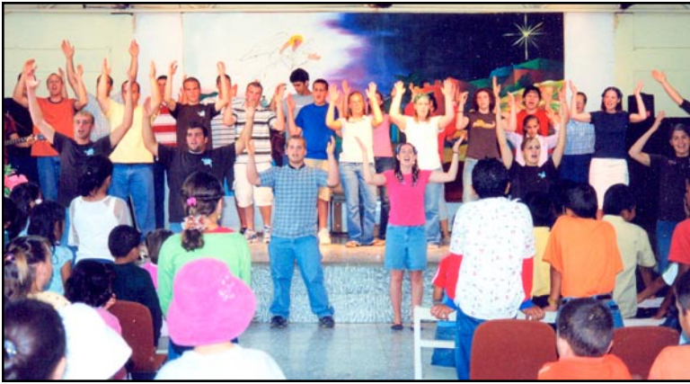
Sunday Morning Service

Sunday morning our group was in charge of the service. Our program included a very short message by one of our young adults, singing (in English) puppets (with a Spanish sound-track), and dramas. All were intended to share the love of Christ and the Gospel message of Salvation. By the grace of God, I trust we planted some seeds or watered the ones that are already growing. There was also a group from Friendship Sports International in attendance for part of the service that morning.