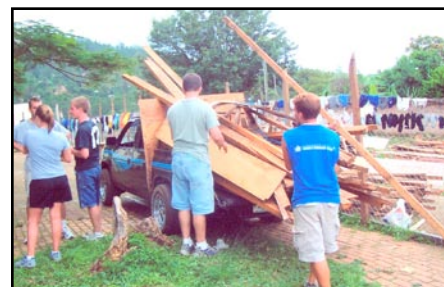
Hauling away the debris.

We used the green pick-up and a basic utility vehicle (a university graduate project on loan to La Finca) to haul away the “mountains” of debris .