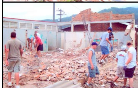
Demolition of the dormitory and bringing down the brick walls.

Thursday morning we started our work projects . They included painting, demolition of the old dormitory, and clearing away of the debris. The work went well and by Monday afternoon we finished tearing down all of the old dormitory.