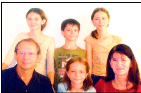
The Provost Family

“Praise the Lord! Praise, O servants of the Lord, praise the name of the Lord! Blessed be the name of the Lord from this time forth and forevermore! From the rising of the sun to its going down the Lord’s name is to be praised.” Psalm 113:1-3.