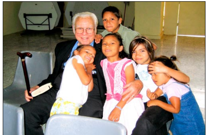
Love is the best therapy!