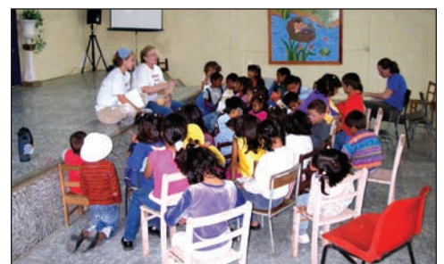
Vacation Bible School