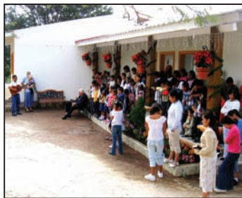
Dedication of Dormitory Units Two and Three to the Lord.