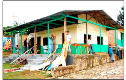
The Library Project.

"Throughout the week the men worked on the library project, tearing down walls, taking the roof off, and laying a couple courses of new block. They also continued working on the housing project pouring a solid concrete reinforcement around the new house to give extra stability in the event of an earthquake. The women and girls worked on various projects: scraping paint off the school building and repainting it; painting new trim for a classroom; cleaning, sanding and painting steel "canaletas" (roof rafters) for the new houses; and baking chocolate chip "whoopie pies" for the children. Some of us sorted through t-shirts our congregation decorated for the children, trying to decide on the appropriate size for each child and then writing their name on it. We also unpacked approximately 75 colorful homemade fleece blankets, which were brought for the children.