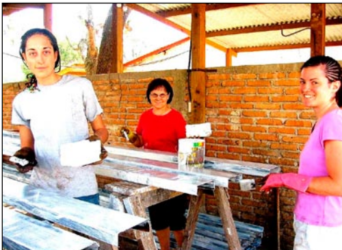
Painting steel "canaletas"