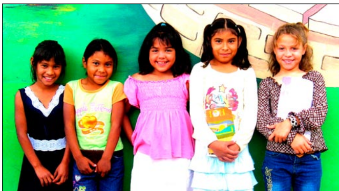
“News to gladden your hearts” Little Girls Receive Jesus

God has blessed us with good teachers at La Finca. Our Mexican volunteer missionaries, who left after Christmas, were wonderful. We miss them, but thank God for all of the “good seed” of His word that has been sown into the children’s lives. Our thanks to each of you who pray, give and go, that all may hear His good news.